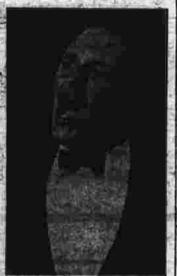
Frank Sinatra appears in NBC's "The Best on Record" Tuesday 8:30-9:30 p.m.

ICE PLANT OPEN Weekdays 8 A.M. to 5:30 P.M. — Sundays 8 A.M. to 1 P.M. CRACKED ICE — BLOCK ICE — CUBES L. T. WOOD CO. 51 BISSELL ST. Phone 643-1120 Turn East from Main St. at State Theater on to Biswell